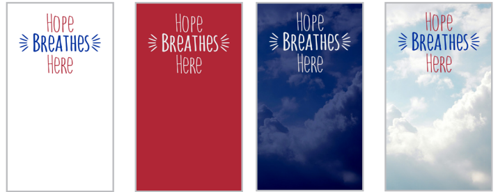
Hope Breathes Here Wallpaper backgrounds

Note: Stories disappear from your profile, Feed and Direct inbox after 24 hours, unless you add them to your profile as story highlights.